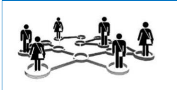
MSCA Doctorates (Previously Innovative Training Networks)