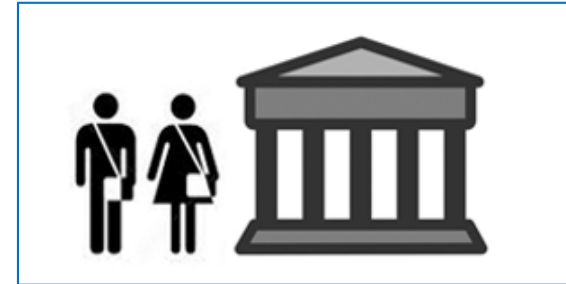
MSCA Postdoctoral Fellowships (Previously Individual Fellowships)